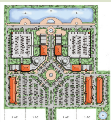
Pine Island Cape Coral, FL