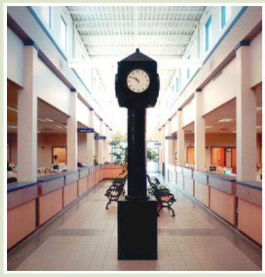
Topics Newspaper Facility Noblesville, IN