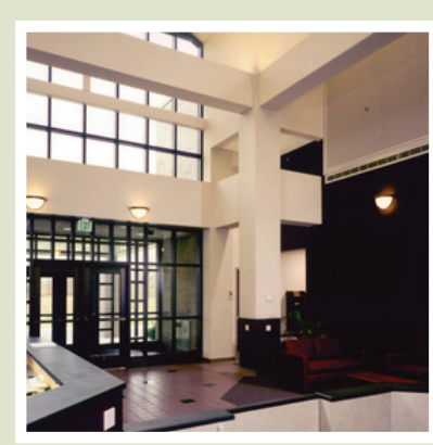
Baxter Pharmaceutical Bloomington, IN